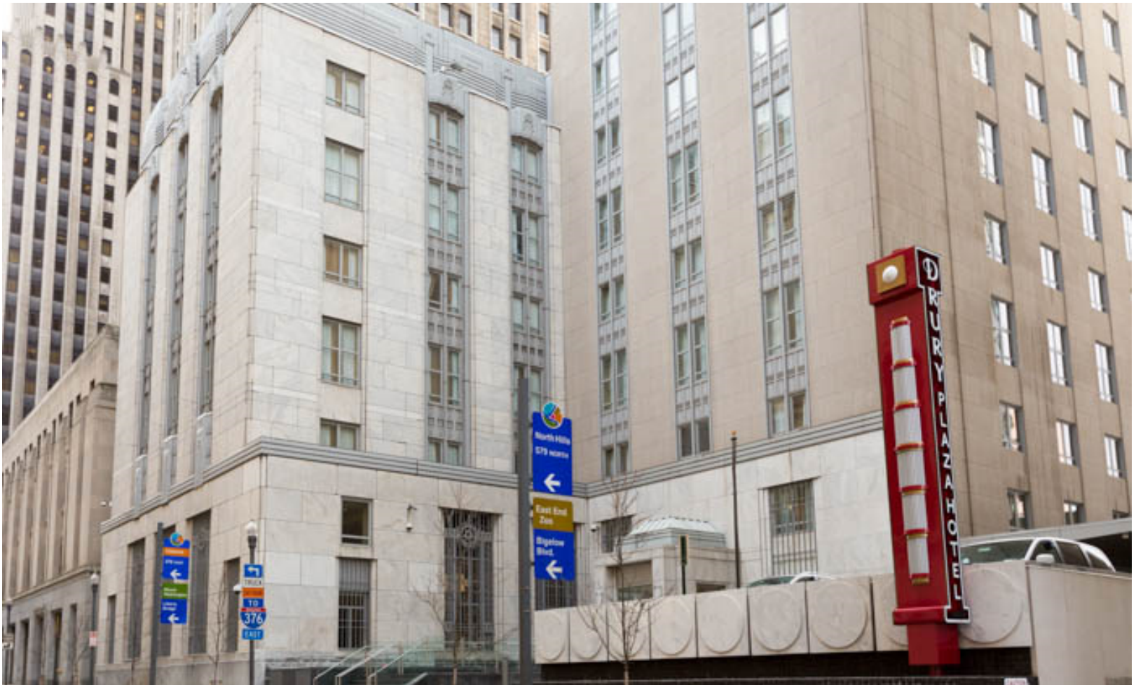
The Drury Plaza Hotel Pittsburgh Downtown opened in February 2017.