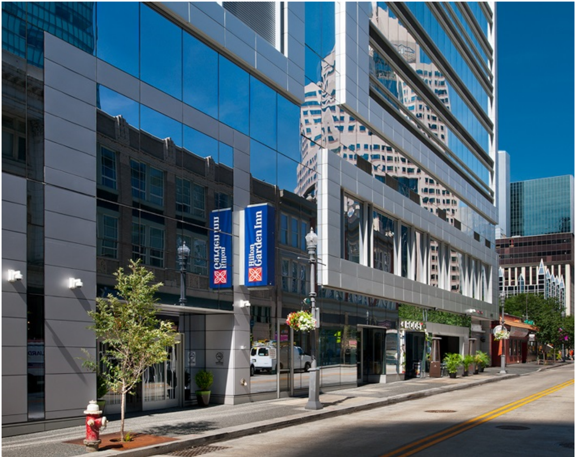
Millcraft Hospitality opened the 197-room Hilton Garden Inn Pittsburgh Downtown in March 2016.