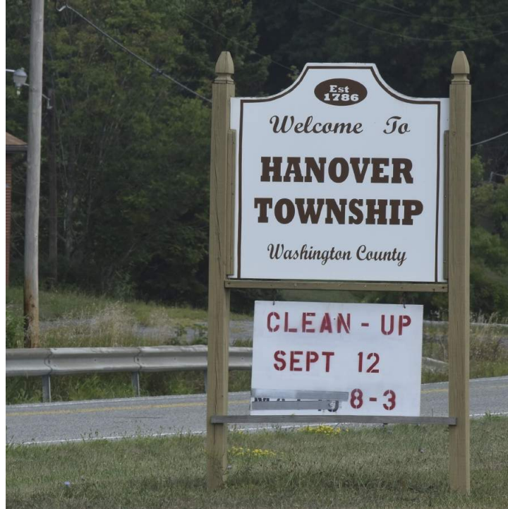
Hanover police arrest three at KeyBank Pavilion