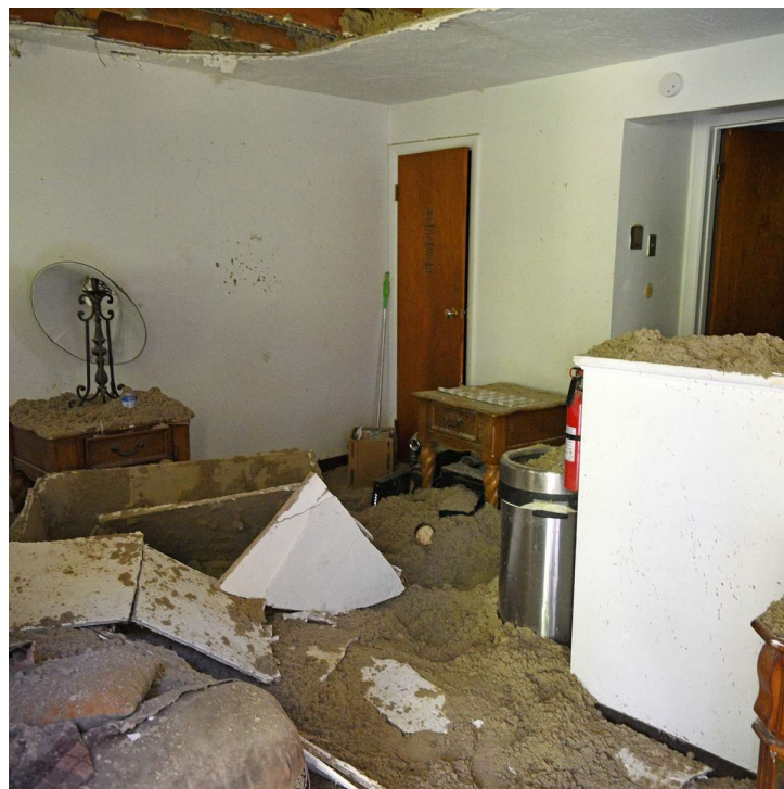
Canonsburg resident displaced by ceiling collapse