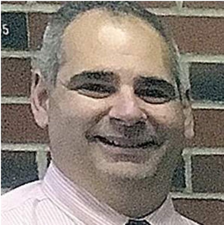
Central Greene superintendent hired to lead northeastern Pa. school district