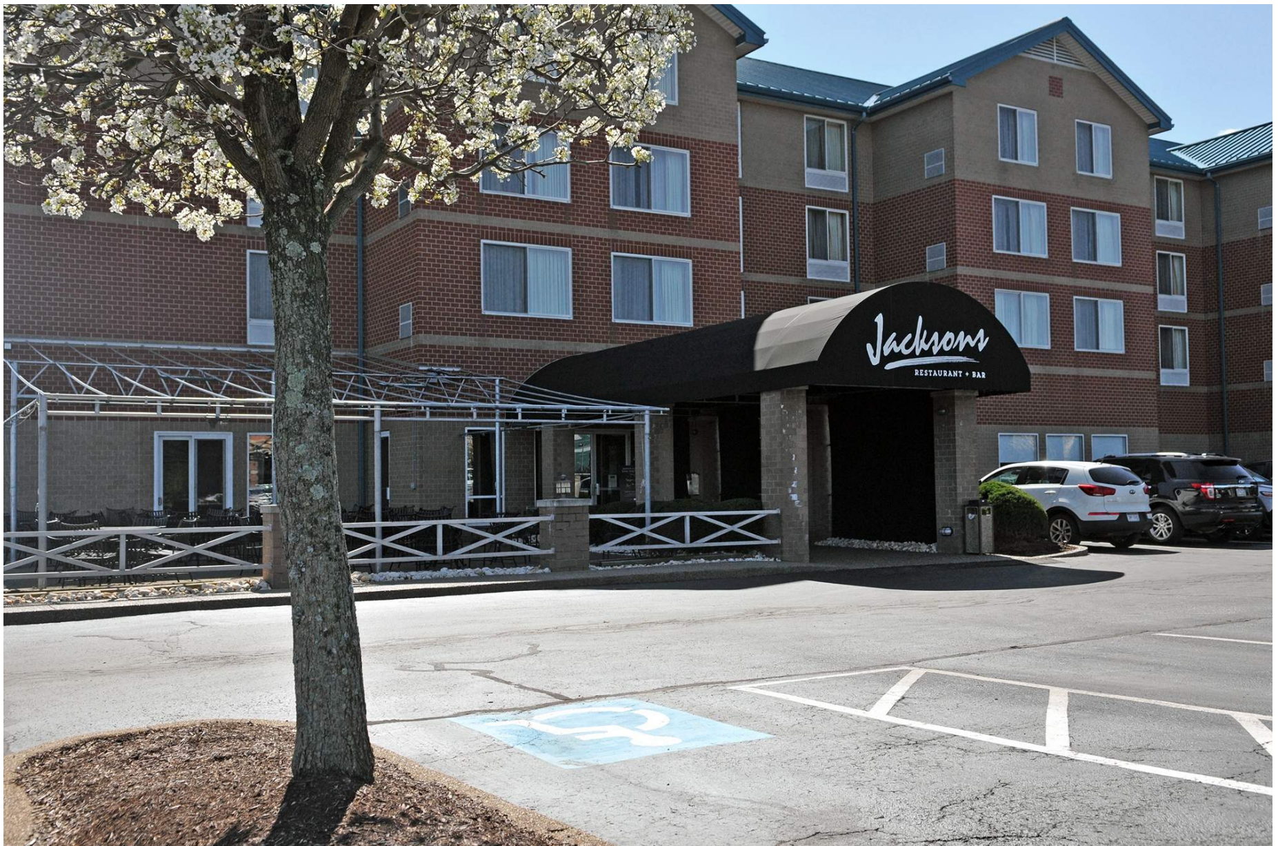
The exterior of Jacksons Restaurant + Bar, Southpointe. Order a Print

Jacksons Restaurant+Bar reopened following a three-month renovation.